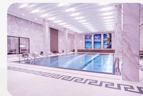
SWIMMING POOL & SAUNA