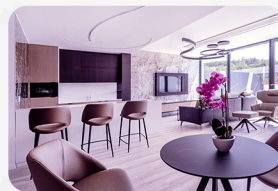
APARTMENT WITH A PRIVATE TERRACE