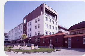
Beroun Rehabilitation Hospital

Our hospitals are equipped with state-of-the-art technologies and have recently undergone renovations to offer the most modern and advanced medical services. We take pride in providing our patients with some of the best healthcare facilities in the country, which are comparable to world-class standards.