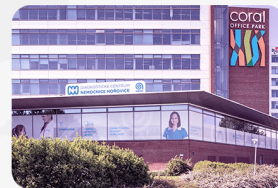
Diagnostic Centre in Prague