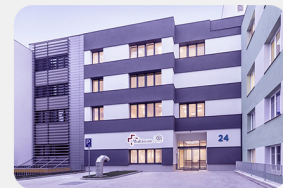
Oncological and Radiological Centre Multiscan