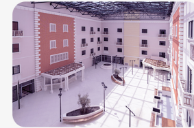
Mental Rehabilitation Centre